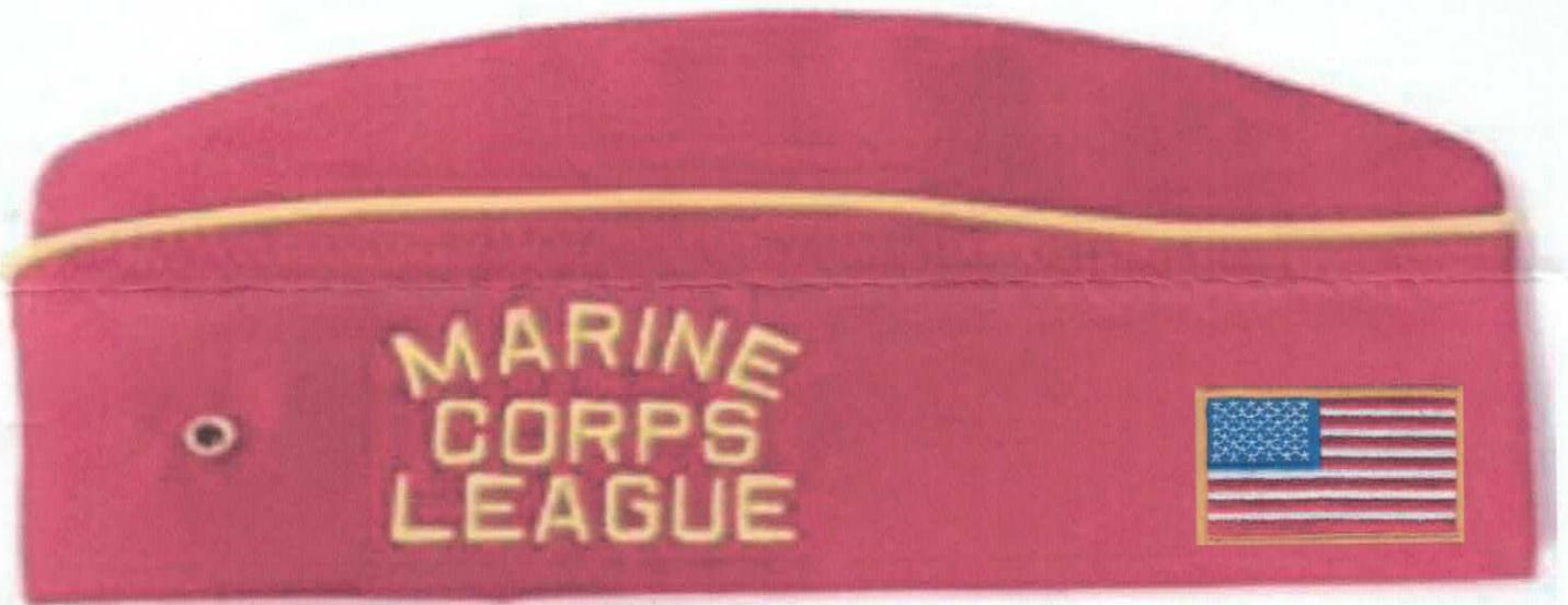
Men's cover: Left rear of the cover 1/2" in from the edge and even with the bottom of LEAGUE.