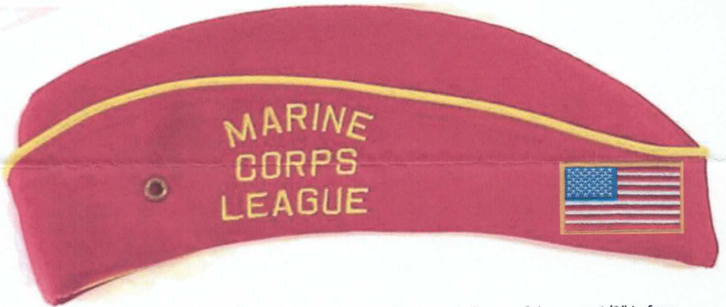
Women's cover: Left rear of the cover 1/2" in from the edge and centered on space available.